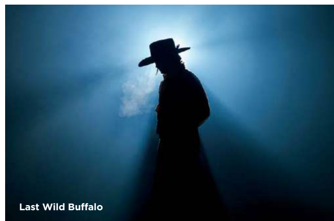
Last Wild Buffalo