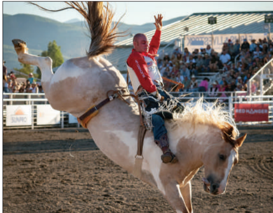
The 91st Annual Oakley Rodeo is a four-day, professional rodeo, Cowboy Association sanctioned event. Featuring buckin' broncos, raring bulls, cowboys, cowgirls and rodeo queens — making this a true Western-rooted celebration. This year's new event on July 6th is called Xtreme Bulls.

1-4 91st Oakley Rodeo Jul 1-4 Oakley Rodeo Grounds oakleyrodeo.com