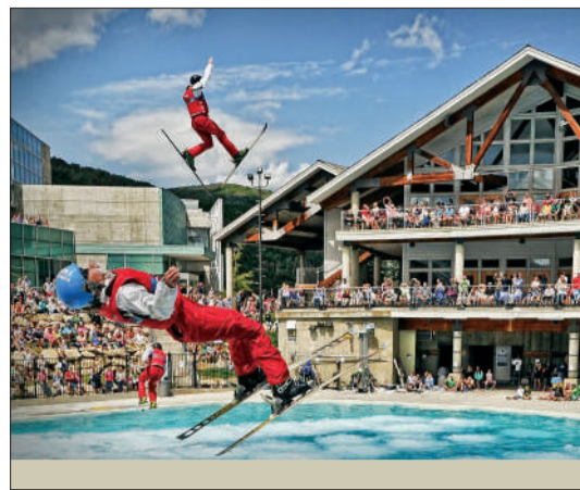
See Olympians and National Team skiers and snowboarders perform acrobatic feats as they soar up to 60 feet in the air before landing in the Park's Spence Eccles Olympic Freestyle Pool. This half-hour choreographed production will leave you breathless!

3-31 Flying Ace All-Stars Freestyle Show Jul 3, 4, 10, 11, 17, 18, 24, 25, 31 — 6 pm Utah Olympic Park utaholympiclegacy.org