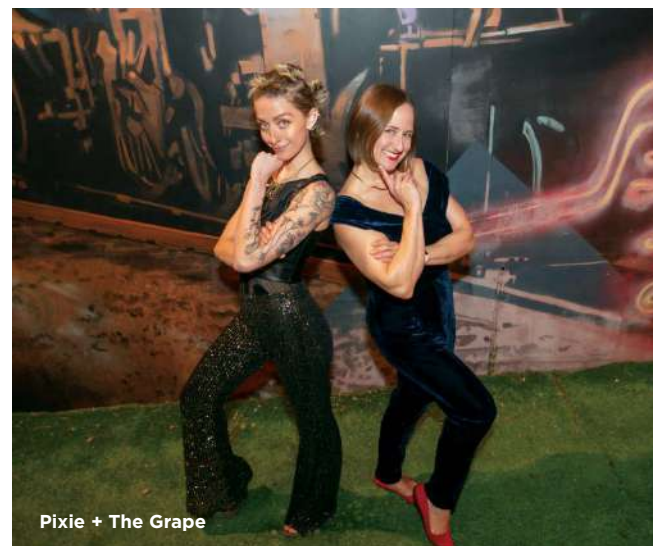
Pixie + The Grape