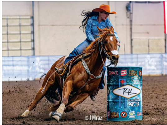
Top riders and horses compete in thrilling barrel racing action. This exciting event showcases incredible horsemanship, speed and skill, making it a must-see for rodeo and equestrian fans.

Apr 17-19 Wasatch County Event Complex utbra.com/futurity