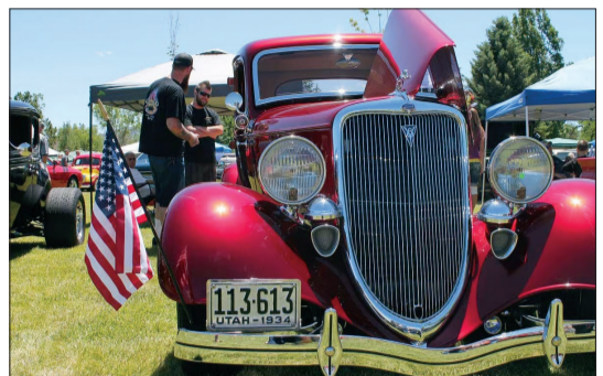
Annual car show party with awards, dash plaques and a "meet & greet" during the car show.

9 CarQuest Heber City Car Show Mar 9, 9 am - 2 pm 434 North Main Street, Heber City jchackett.com/events/2025/5/10/heber-carquest-free-car-show-434n-main-st-435-654-1520-jason-7pn32