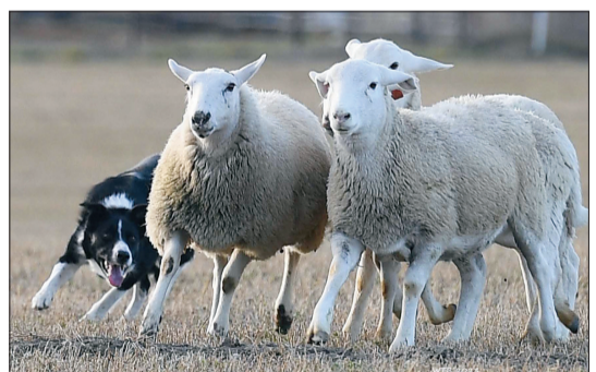
Since 2003, this event continues to be one of the foremost of its kind in the world, with competitors this year from Wales, South Africa, Switzerland, Ireland and all over North America. The sheep and dogs navigate this difficult course with four days of competition plus family friendly educational demonstrations, children's activities, sponsor booths, information booths, vendors, a Utah Olympic Legacy Foundation hosted Bohemian Beer Garden and more.

22 Classic Sheepdog Championship and Festival May 22 - 25, 8 am - 5 pm Soldier Hollow soldierhollowclassic.com