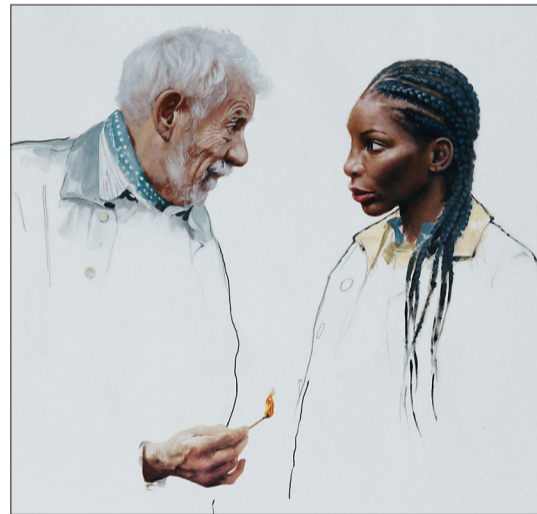
Please check the web site for more films scheduled after the publication of this calendar.

parkcityfilm.org May 1-3 Idioka May 8-10 Omaha May 14 Made in Utah: Film Showcase (free admission) May 15-17 The Christophers