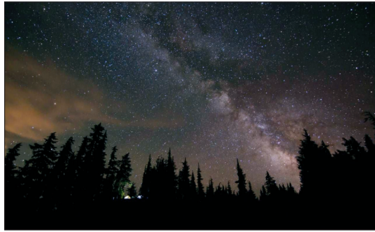
Enjoy stargazing and learning about dark skies with hands-on activities and starry treats.

Apr 17, 7-10 pm Wasatch Mountain State Park Golf Course Clubhouse friendsofwasatchmountainstatepark.org/park-events/#!event/2026/4/17/dark-sky-celebration-2026