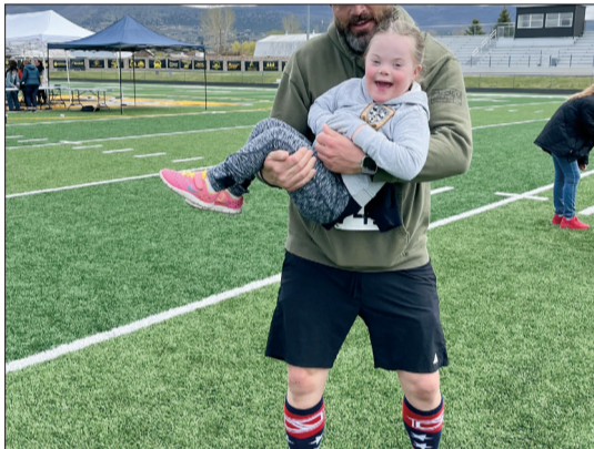
Come join the annual Wasatch PEAK 5K. PEAK is a local non-profit organization comprised of parents of kids with special needs. Our mission is to create educational, employment and recreational opportunities to kids in our valley that would not otherwise be available.

2 Wasatch PEAK 5K May 2, 10-11 am Wasatch High School sites.google.com/view/wasatchpeakparents/home?authuser=0