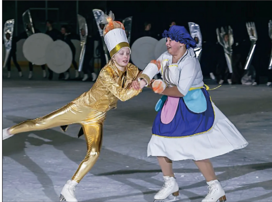
This performance will show off Park City's finest. A fun performance for all.

1-3 A Frozen Adventure On Ice May 1, 7 pm May 2, 3 & 7 pm Figure Skating Club of Park City figureskatingclubofparkcity.org