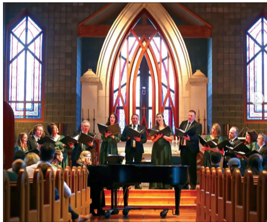
Experience the beauty of night through song. Evensong is a program of music by Whitacre, Ešenvalds, Lauridsen, Hagenberg, Lloyd-Webber and others. From luminous choral works to beloved melodies, this concert explores music of stillness, longing, and awe.

wasatchcamerata.com Apr 24, 7:30 pm at Rising Heights Academy, Midway Apr 25, 7:30 pm at St. Lawrence Church, Heber City