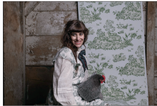
The Author Series strives to highlight authors whose books convey a meaningful message or tell a story that impacts our communities and environment. Through the years the Resort has featured notable authors, including Madeleine Albright, Jimmy Carter, Maureen Dowd, Bob Schieffer, Michael Pollan, E. O. Wilson, Jeff Flake, Eric Schlosser, Katherine Eban, Pat Mitchell and Bob Woodward.